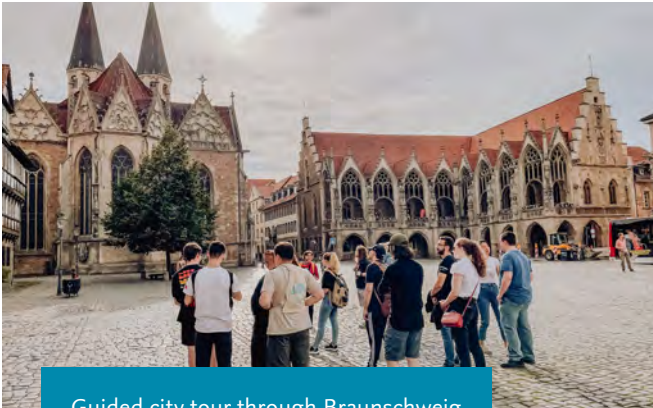
Guided city tour through Braunschweig