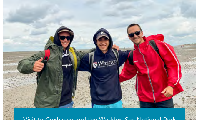
Visit to Cuxhaven and the Wadden Sea National Park