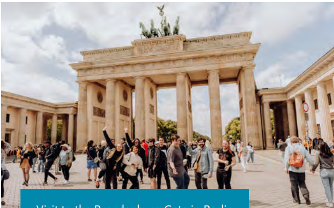
Visit to the Brandenburg Gate in Berlin